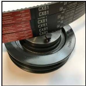
Sheaves & V-belts